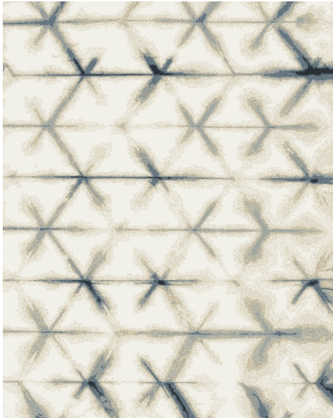
Suji – Gold from the Creative Matters Arashi Collection. Handknotted in wool and silk.

Toronto, Canada—March 15, 2018: Known as the go-to custom floor and wallcoverings firm for designers of many of the world's most prestigious retail and hotel brands and embassies, Creative Matters will present its fair trade carpets for the second time at DOMOTEX asia/CHINAFLOOR — the leading flooring trade exhibition in the Asia-Pacific region — March 20 to 22, 2018, Shanghai New International Expo Centre, Pudon: Stand #W5 K05 Cover Luxury Brands.