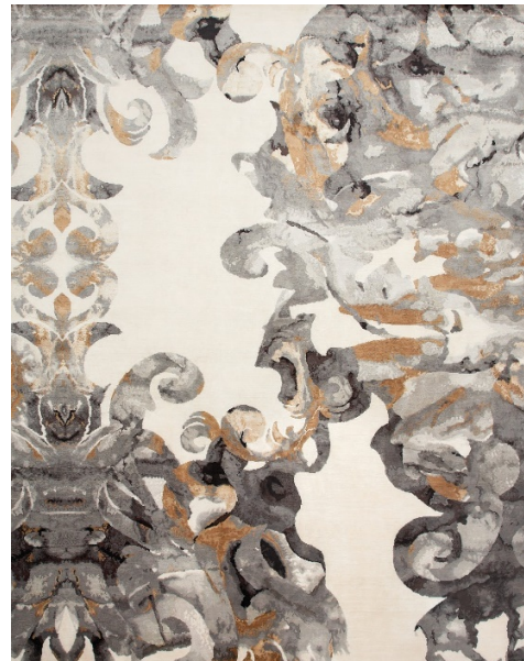
Dream – Gold and Silver from the Creative Matters XXV Collection. Handknotted in wool and silk.